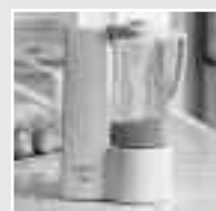
PiMag™ Optimizer II