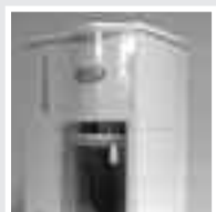
PiMag™ Aqua Pour™ Express Gravity Water System