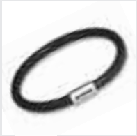
TriPhase™ Sport Bracelet