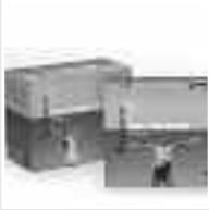
Kenzen™ Wellness Daily Nutrition Pack