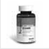
Kenzen™ Detoxifying Cleanse