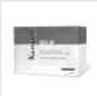
Kenzen™ Rev Up