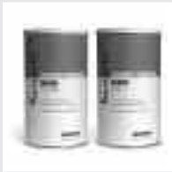
Kenzen™ Creamy Protein Shakes