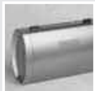
Air Wellness™ Traveler