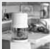
PiMag™ Aqua Pour™ and PiMag™ Aqua Pour™ Deluxe Gravity Water Systems