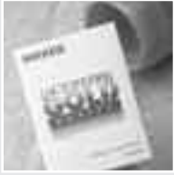
Lactoferrin Gold 1.8™