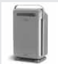
Air Wellness™ Power5 Pro™