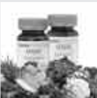
Kenzen™ Fruit & Berry/Vegetable