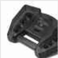
Biaxial Body Energizer™