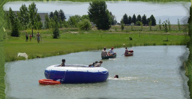
In 2003 we added the water slide and the pole swing.